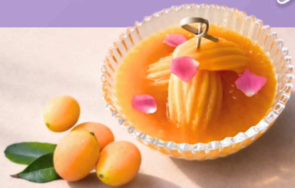
Marian Plum Panna Cotta THB 120 NET